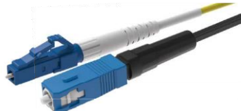
Fusion Splice-On Connector(FSOC)